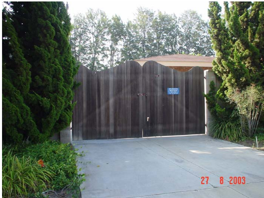
Existing Front Gate and Road Access to Pump Station Looking at existing front gate that provides access from Yellowtail Drive to enclosed pump station and contained project site