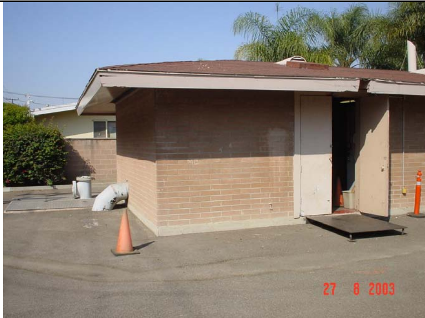
Existing Pump Station Building Looking at enclosed pump station from within contained project site